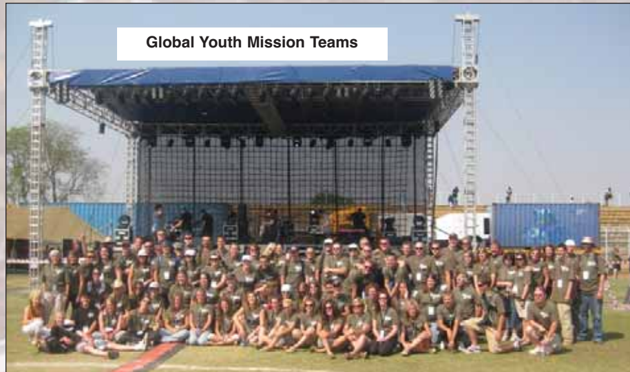
Global Youth Mission Teams

Sitting in the balcony of Lilongwe Pentecostal Church, I wondered if Youth Conference Malawi would actually happen. Then, when I saw the first bus arriving, full of Canadian young people, I looked heavenward and said, "Thank You, Lord." Minutes later, the church was filled with energetic people, passionate to share Christ.